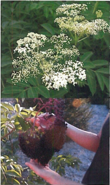
Plantings & Mics