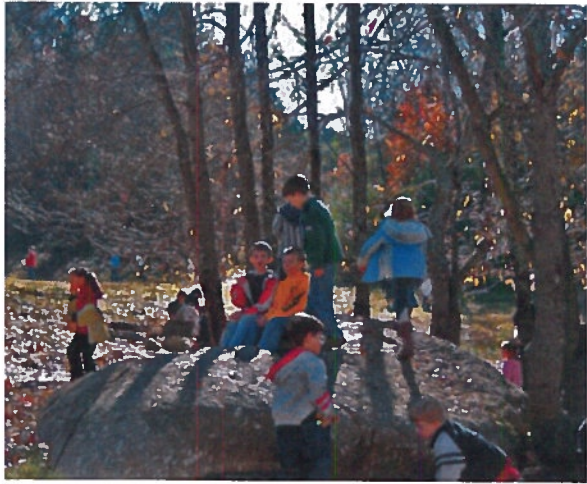
Social and Quiet Play Zones